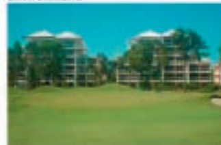
2000m²/slab placed at 2.5m below water table to waterproof six story units.