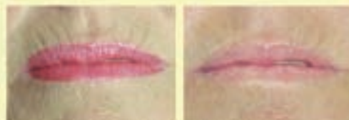
Female before and after 90 days use