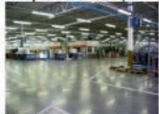
Industrial concrete floor performed excellent finishing without curing after.