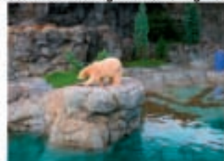
Polar Bear Shores in the cooled marine environment.