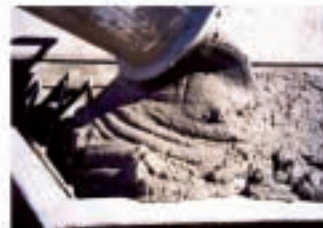
Creamy concrete flow / slump 65 mm