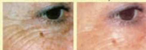
Female before and after 60 days use

Distributors wanted for this exclusive Spa Quality Line of Natural & Organic Skin Care. Featuring a full line of clinically proven Anti-Aging, Anti-Wrinkle products ... plus body care that will improve you from head to toe. Nutra-Lift® products are made with the highest concentration of natural & organic extracts, plus the most advanced technological ingredients that guarantee results. Skin Care that can reduce the look of wrinkles, improve the color, tone & clarity, moisturize & smooth the skin... in easy to use All-in-One Step products. You can also Private Label any of our many premium Facial Care, Body & Personal Care, Sun Protection (SPF) or Hair Care products.